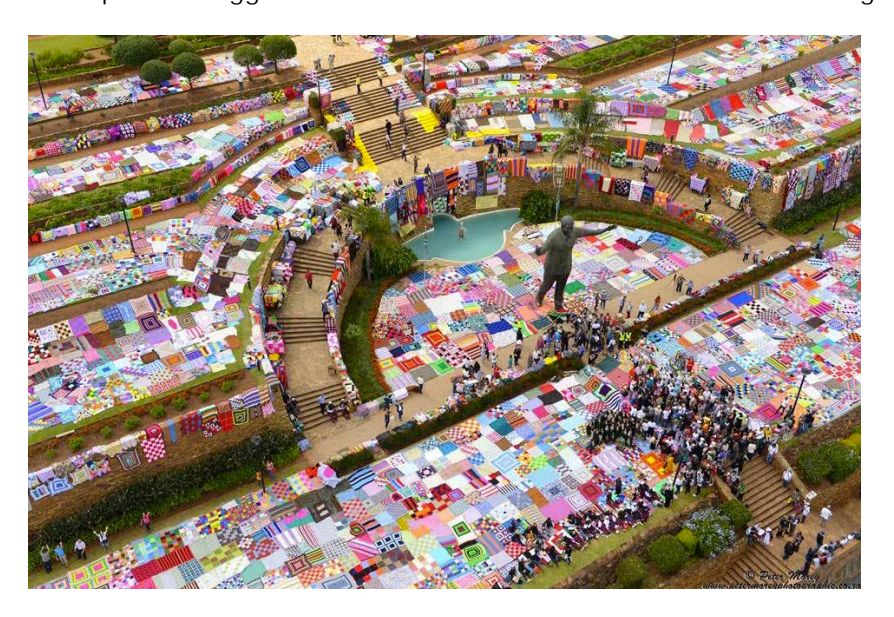
Figure 1: Union building terrace, Pretoria South Africa

The 67 minutes for Mandela campaign is a global call to action that celebrates the idea that each individual has the power to transform the world and has the ability to make an impact. This is commemorated on the birthday of Nelson Mandela and the message is: "Nelson Mandela has fought for social justice for 67 years. We're asking you to start with 67 minutes" (Nelson Mandela Foundation 2015). Considering knitting or crochet as a time consuming activity, it was identified as a fitting and suitable link to the project. The project was aprt of a bigger drive and the outcome of this is shown in Figure 1.